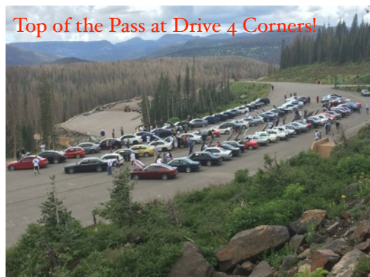
Top of the Pass at Drive 4 Corners!