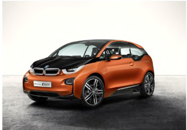
2014 BMW i3

The daily operating expenses (not including maintenance) of the electric vehicles are much less expensive than that of gas vehicles. An extremely simplistic calculation is as follows: PNM's current rates with taxes and fees are approximately 12.5 cents per kilowatt hour. A typical person drives 12,000 miles a year which equates to 33 miles per day average. BMW estimates the range of the i3 to be 80 to 100 miles. Assuming the low end due to the elevation changes in Albuquerque, this means one would use approximately 41% of the i3 battery on an average day. This works out to 7.6 kWh per day to recharge the battery. At PNM's current price for electricity this equates to 95 cents per day in electricity or $346 a year. The similarly priced BMW 320i is EPA estimated at 24 mpg city, which equates to 1.38 gallons of fuel for the same 33 miles. My local Phillips 66 has 91 octane (required for turbo engines) for $3.19 a gallon. This equates to $4.39 per day or $1600 a year in gasoline.