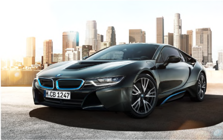
2015 BMW i8

It is roughly ¼ the cost to operate an electric vehicle. For those with solar power, the cost is even less. Along the lines of solar, Affordable Solar on Pan American Freeway held an Electric Vehicle Event October 26. I'm sure we'll see many more of these events in the future for this emerging market.