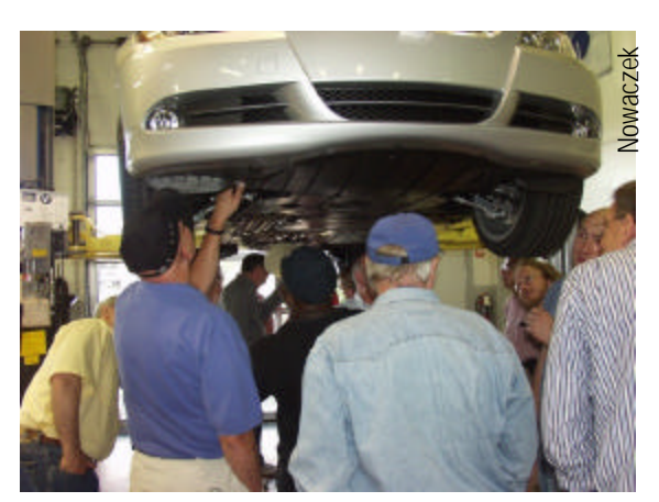
Under the car is starting to look like under the hood... everything's covered up!